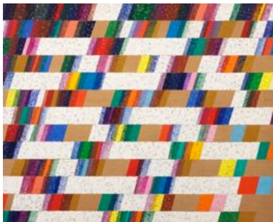
Piero Dorazio, Section d'or I° , 1979 Oil on canvas, 130 x 160 cm