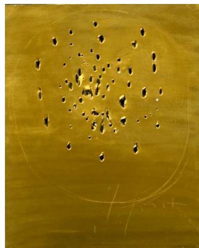
Lucio Fontana, Concetto spaziale , 1964 Oil and graffiti on canvas, 82 x 65 cm