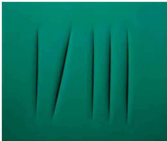
Lucio Fontana, Concetto spaziale, attese , 1968 Water-based paint on canvas, 53,5 x 64,5 cm