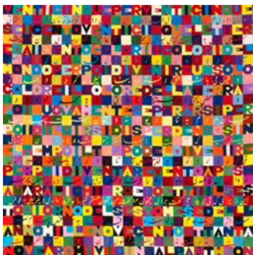
Alighiero Boetti, Il sesto giorno del sesto mese dell' anno millenovecentottantanove , 1989 Embroidery, 101 x 110 cm